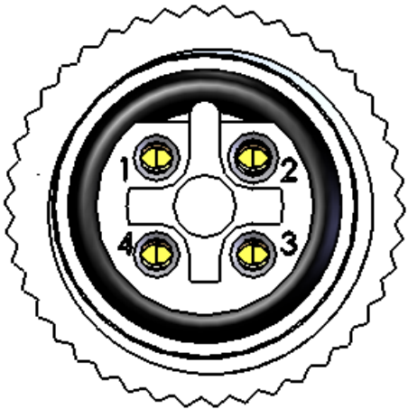
DETAIL A SCALE 4 : 1