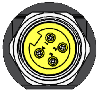
DETAIL A SCALE 2 : 1.5